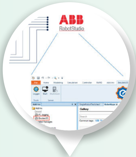
Picture: Emulate3D Simulator enables the connection of robot simulators

For robots, it is also possible to have the axis positions controlled by a connected robot simulator or control emulator to simulate real trajectory. Standard interfaces to Fanuc Roboguide, Omron ACE, ABB Robotstudio and Yaskawa MotoSim are available for this purpose.