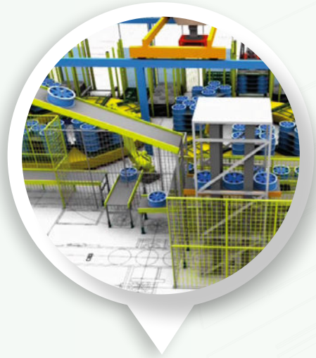
Picture: Simulation model of a tyre assembly, -sorting and buffering system

MagneMover® is an intelligent and cost-effective conveyor system from Rockwell Automation, designed to move light loads quickly and efficiently. For the simulation of these systems, Emulate3D Simulator provides a catalog that allows systems to be quickly modelled and simulated.